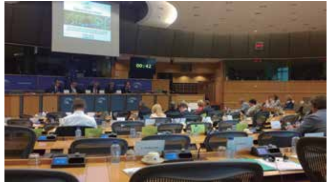
Gottlieb Basch presenting the report at the European Parliament in July 2017.