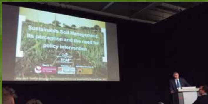
ECAF President giving an oral presentation about sustainable soil management in the EGU General Assembly 2017, Vienna (Austria), April 25 th 2017.

ECAF participated in the European Geosciences Union (EGU) General Assembly 2017 within the scientific session entitled "Land Degradation and Development", last April 2017. An open session where the societal, economic and biophysical aspects of the Land Degradation were discussed, from methods and approaches to results.