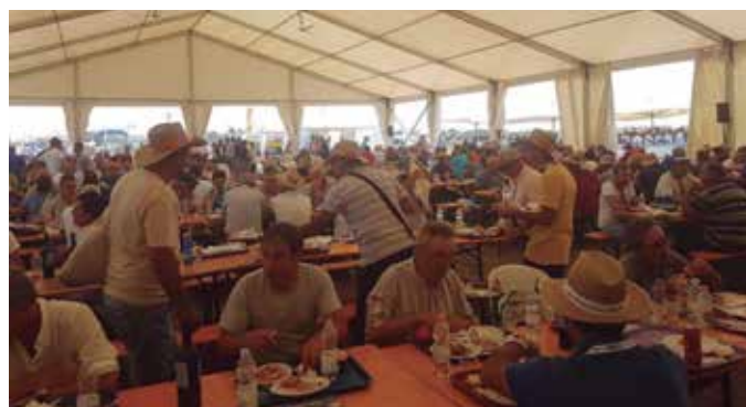
“Nova Agricoltura in Campo” in Foggia (Puglia, Southern Italy) July 20 th 2017

AIGACoS, the Italian Association for Conservation Agriculture, has contributed to the organization of “Nova Agricoltura in Campo” a Field Day for transferring of research results and technologies available, to over 1200 farmers and professional technicians. Is this Day innovations for farming without tillage / ploughing that are now available for all operating conditions. In Puglia and other 15 regions of Southern Italy, the renewed focus on CA is related to CAP support measures that have allocated up to 320 €/ha to farmers who adopt conservation agriculture for some annual crops (durum wheat and legumes). During the tour dedicated to CA, technicians of the present companies have demonstrated the wide range of solutions offered within “Nova Agricoltura in Campo”: direct drilling machinery with disc and anchors, and machines for minimum tillage adaptable to the most diverse types of soils. Besides, Low Pressure Tires, and Technologies of Precision Agriculture. Rippers and decompactors have completed the range of field demonstrations for those who have decided not to plough any longer the cereal croplands. A lively and interactive tour took place, with attentive and prepared visitors who have addressed to exhibitors a number of qualified technical questions.