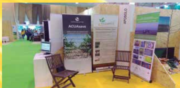
APOSOLO stand in the 54 th National Agricultural Fair, Santarém (Portugal).

APOSOLO participated in the 54 th National Agriculture Fair, which took place from June 10 th to the 18 th in Santarem, promoting the work developed by APOSOLO.