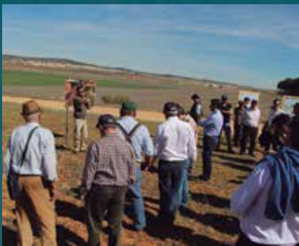
Field day tour. Visit to "Munibañez farm". Albacete (Spain), March 9 th 2017.