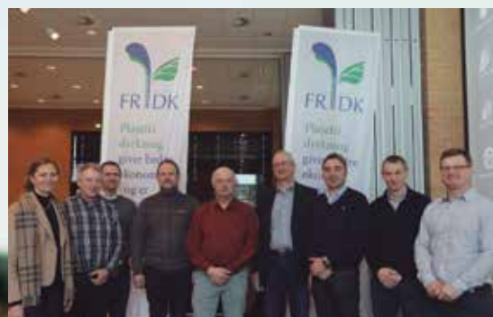
Members of FRDK at their annual meeting. March 2017.

The Danish Association for Conservation Agriculture (FRDK) held last March its annual meeting. It counted on 100 enthusiastic farmers and many speakers that showed a high interest and awareness in implementing the CA techniques. Studies and trials on a number of different species such as beetles and spiders under CA management were presented.