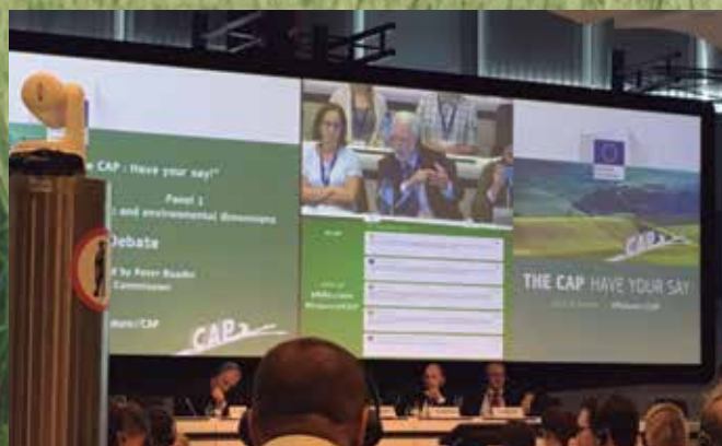
Workshop 'Have your say!' organised by DG AGRI, Brussels, July 7 th 2017.

In this context, ECAF participated in the European Workshop that the Directorate-General for Agriculture and Rural Development (DG AGRI) hosted to present the results of the consultation on the future CAP last July 7 th in Brussels.