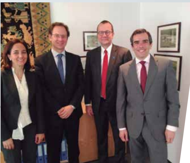
ECAF and COPA-COGECA meeting participants. Brussels, March 27 th 2017.

ECAF and some of its National Associations participated in the 7 th World Congress on Conservation Agriculture held in Rosario (Argentina) last August. Manifold oral presentations, posters, panels, debates and workshops were held in this framework to come up with practical solutions based on Conservation Agriculture to be able to produce crops / food, feed and fibers with the lower possible greenhouse gas emissions.