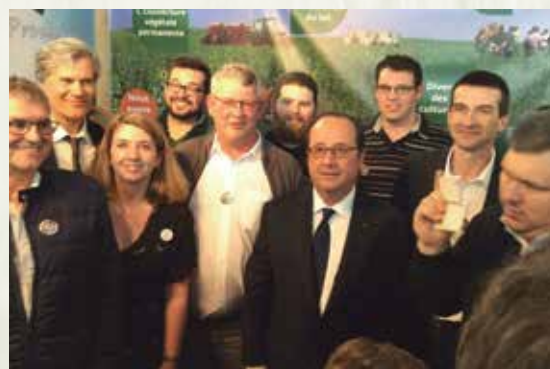
APAD team with Francois Hollande, President of France in the 'Salon de l'Agriculture'. Paris (France), March 2017.