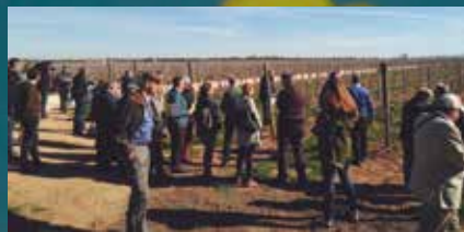
Field day tour at 'Dehesa de los Llanos'. Albacete (Spain), March 9 th 2017.