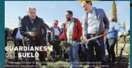
Field day tour at 'Dehesa de los Llanos'. Albacete (Spain), March 9 th 2017.