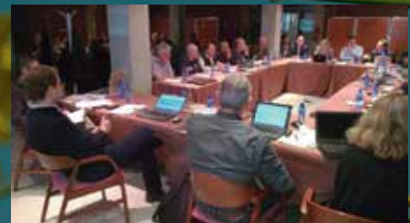
Participants at ECAF General Assembly. Albacete (Spain), March 8 th and 9 th 2017.