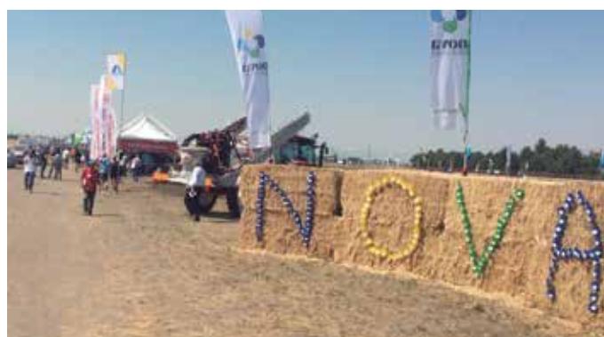
Entrance of the field day event, “Nova Agricoltura in Campo” in Foggia (Puglia, Southern Italy) July 20 th 2017.

AIGACoS, the Italian Association for Conservation Agriculture, has contributed to the organization of “Nova Agricoltura in Campo” a Field Day for transferring of research results and technologies available, to over 1200 farmers and professional technicians. Is this Day innovations for farming without tillage / ploughing that are now available for all operating conditions. In Puglia and other 15 regions of Southern Italy, the renewed focus on CA is related to CAP support measures that have allocated up to 320 €/ha to farmers who adopt conservation agriculture for some annual crops (durum wheat and legumes). During the tour dedicated to CA, technicians of the present companies have demonstrated the wide range of solutions offered within “Nova Agricoltura in Campo”: direct drilling machinery with disc and anchors, and machines for minimum tillage adaptable to the most diverse types of soils. Besides, Low Pressure Tires, and Technologies of Precision Agriculture. Rippers and decompactors have completed the range of field demonstrations for those who have decided not to plough any longer the cereal croplands. A lively and interactive tour took place, with attentive and prepared visitors who have addressed to exhibitors a number of qualified technical questions.