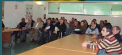
Members of ECAF and other stakeholders at the ASALBAC presentation. Albacete, March 9 th 2017.