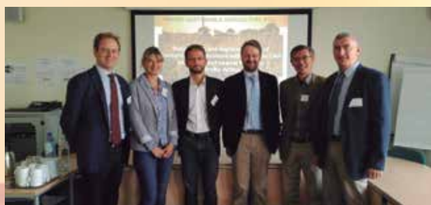
Meeting participants in Directorate-General for Agriculture and Rural Development, September 2017.