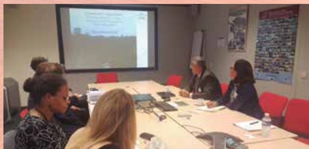
Work-meeting with participants of Directorate General for the Environment and of Directorate General for Climate Action, October 2017.

ECAF organised a workshop in Brussels to make the most of synergies between the national associations promoting conservation agriculture. In this workshop a position paper concerning the public consultation on the future of the Common Agricultural Policy (CAP) launched by Commissioner Phil Hogan was written. ECAF submitted its position paper and the reply to the consultation, highlighting the opportunity that CA represents for the modernisation and simplification of the CAP.