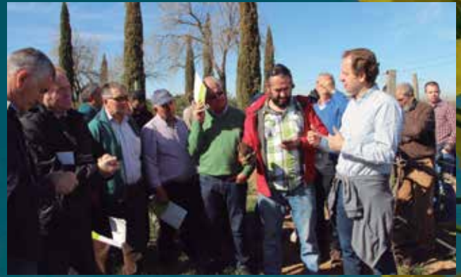
Field day tour at 'Dehesa de los Llanos'. Albacete (Spain), March 9 th 2017.

7 ECAF held its last General Assembly in Albacete (Spain) on the 8 th of March, 2017. Issues such as the state-of-the-art of the different National Associations (almost all of them were represented), or the manifold advocacy actions that are being carried out on behalf of the European Conservation Agriculture community were tackled. Likewise, and as it was scheduled in the agenda of the meeting, a new board was appointed to the European Federation. Additionally, on March 9 th 2017, General Assembly attendees enjoyed a field day tour at Dehesa de los Llanos and Munibañez Farm.