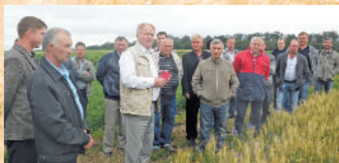
Participants at the seminar for farmers organised in Republic of Moldova (PROCORE).

Long term field experiments on Conservation Agriculture with different crop rotations have been undertaken in Balti, Republic of Moldova jointly with some researches at Selectia Research Institute of Field Crops.