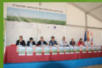
Opening session and view of the attendees at the International Field day on CA. Barruelo del Valle, Valladolid, (Spain).