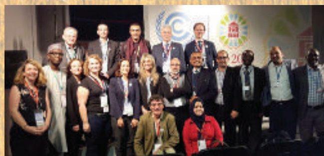
GCAN members attending the COP 22 in Marrakech, November 17 th .

ECAF is a partner of the Global Conservation Agriculture Network (GCAN) recently composed by 17 members including farming organisations, researchers and policymakers from all the world. GCAN aims to provide solutions which help meet the current farming challenge and which ensures that agriculture is more resilient, while still guaranteeing greater food security and sustainability in all climatic conditions.