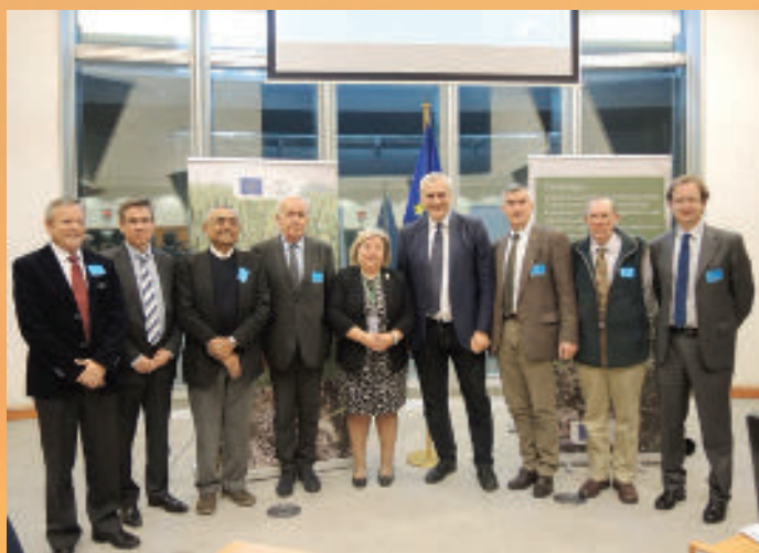
Participants in the seminar “Making sustainable agriculture real” organized in the European Parliament.