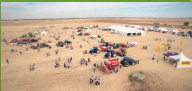
Bird's eye view of the International Field Day of Conservation Agriculture. Barruelo del Valle, Valladolid, (Spain).

☞ With the participation of more than 1,800 farmers, the AEAC.SV held the international field day on Conservation Agriculture in Barruelo del Valle (Valladolid-Spain) last September 22 nd . This event has been a success not only because of the large number of participants, and the impact on the media (TV, radio and press), but also because of the effective advocacy for the Spanish Ministry for Agriculture, Food and Environment and other key administrations. Policy makers openly supported conservation agriculture as the basis for the new reform of the CAP 2020.