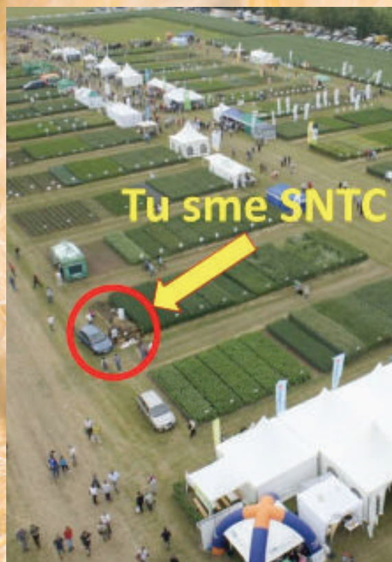
Bird's eye view of the Slovak Field Day, (Slovakia).

SNTC was invited to participate in education activities during the Slovak Field Day on 7 th and 8 th June 2016. It is one of the biggest exhibitions of field of agriculture in Slovakia with many visitors from the country and also from abroad.