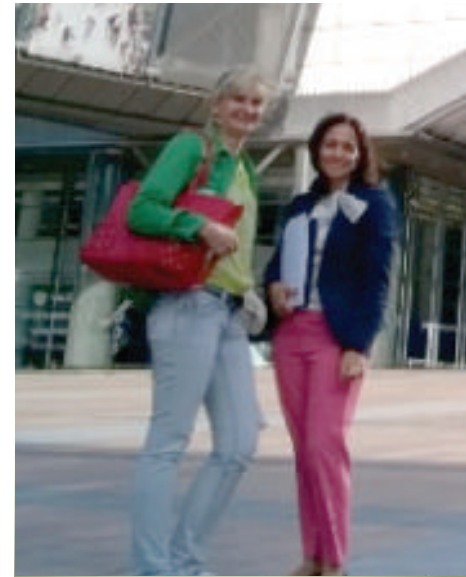
ECAF Vice-president at the European Parliament in Brussels for advocating the Written Declaration on CA.

November 7 th , COP 22. Some members of ECAF jointly with FAO took part in the COP 22 side event named “Climate Change Mitigation and Sustainable Food Security with Conservation Agriculture in Africa and the Mediterranean Region”. Mitigating the impact of Climate Change and Ecosystem Services were the subjects tackled on behalf of ECAF. Likewise, in November 17 th , COP 22. Some other members of ECAF had the chance jointly with the Spanish Association for Conservation Agriculture (AEAC.SV) to exchange insights with the Spanish Minister on Agriculture, Ms García-Tejerina, on the manifold benefits to mitigate climate change CA could offer within the 4 per 1000 initiative in Spain. Agriculture and climate change are closely linked, since agricultural activity can positively or negatively affect global warming.