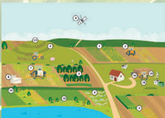
15 INSPIA Best Management Practices.